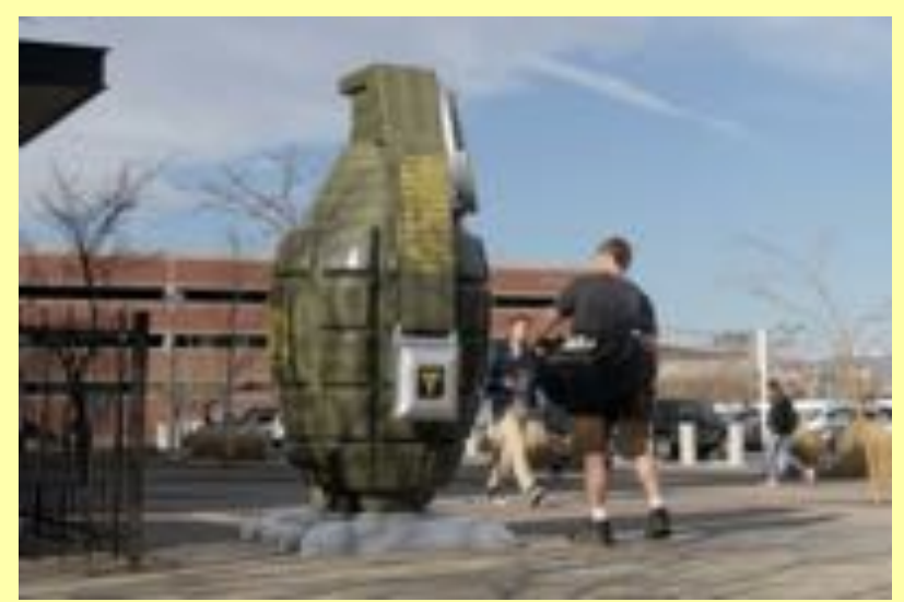
The 9-foot-tall safety message grenade is displayed around Colorado in hopes of encouraging people to buckle up.

The llex interchange is the first segment to be constructed as part of the New Pueblo Freeway.