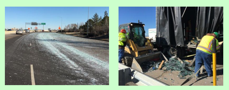
I-25/Ilex team members help clean up after truck spill

A tractor trailer hauling mirrors lost its load traveling on northbound I-25 on a Monday morning in late February. The spill occurred on I-25 near City Center Drive, and resulted in closure of the Interstate for cleanup operations.